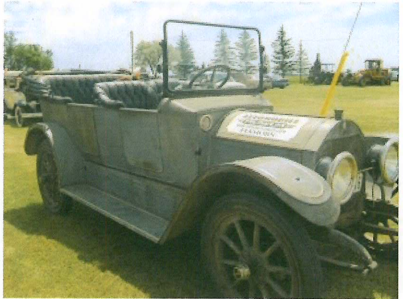
1913 J. I. Case Model 30 Touring Sedan